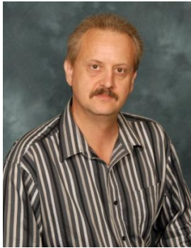
Roy Brown Supplies